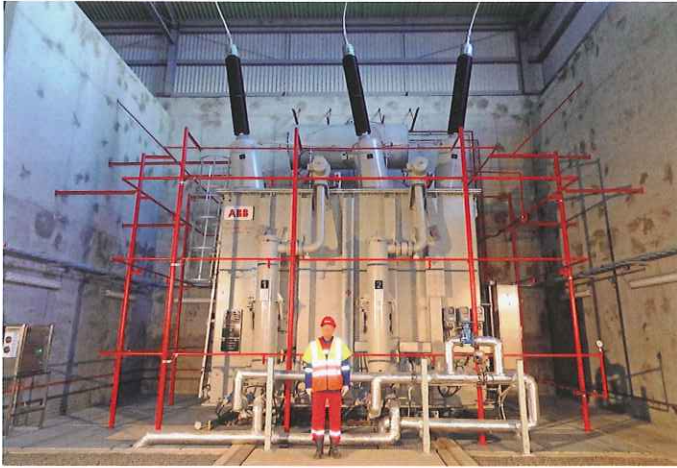
Largest transformer in Iceland