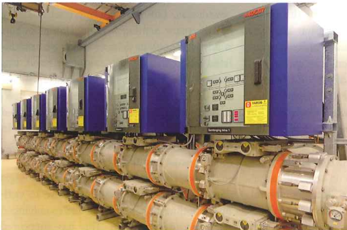
132 kV GIS (Gas Insulated Switchgear) operated at 60 kV

The concept is to add a stepdown transformer, 200 MVA, and two thyristor rectifiers, 75 kA, 900 V DC, dedicated to Potlines 1 and 2 for the creep concept. The idea is to continue operation of the four old rectifier units for each of the Potlines 1 and 2 as the most valuable part of this equipment has a remaining lifetime of some 30 years. Then normal