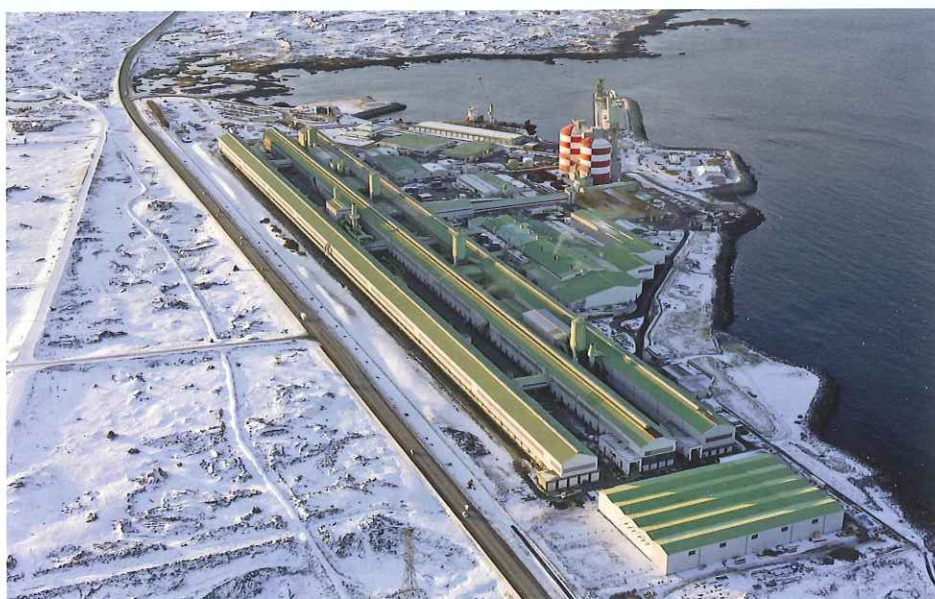
RTA Isal at Straumsvik, Iceland

Back then, Alusuisse looked for further investments and pursued the option of a new potline with identical pots but with bigger and magnetically optimised DC-busbars. The rated current intensity of Potline 3 is 135 kA with four rectifier units. In 2000 the filter system for rectifier C was extended to enable current intensity above 140 kA and in 2004 the fifth