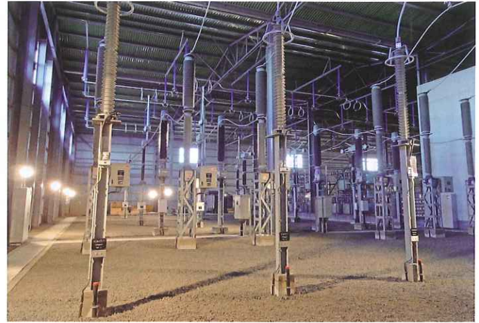
220 kV AIS (Air Insulated Substation)

ciency, as well as for fewer anode effects, thus reducing the release of greenhouse gases. The merit of Isal in this context is high on a world wide scale.